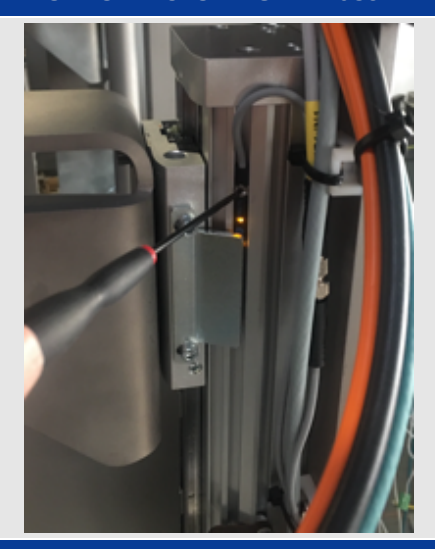
OPTION: REJECT CYLINDER

The optional Rejecter is mounted inside the machine It will reject the bottle onto the chute and the bottle will fall into a reject bin